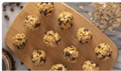
No-Bake Peanut Butter & Chocolate Bites